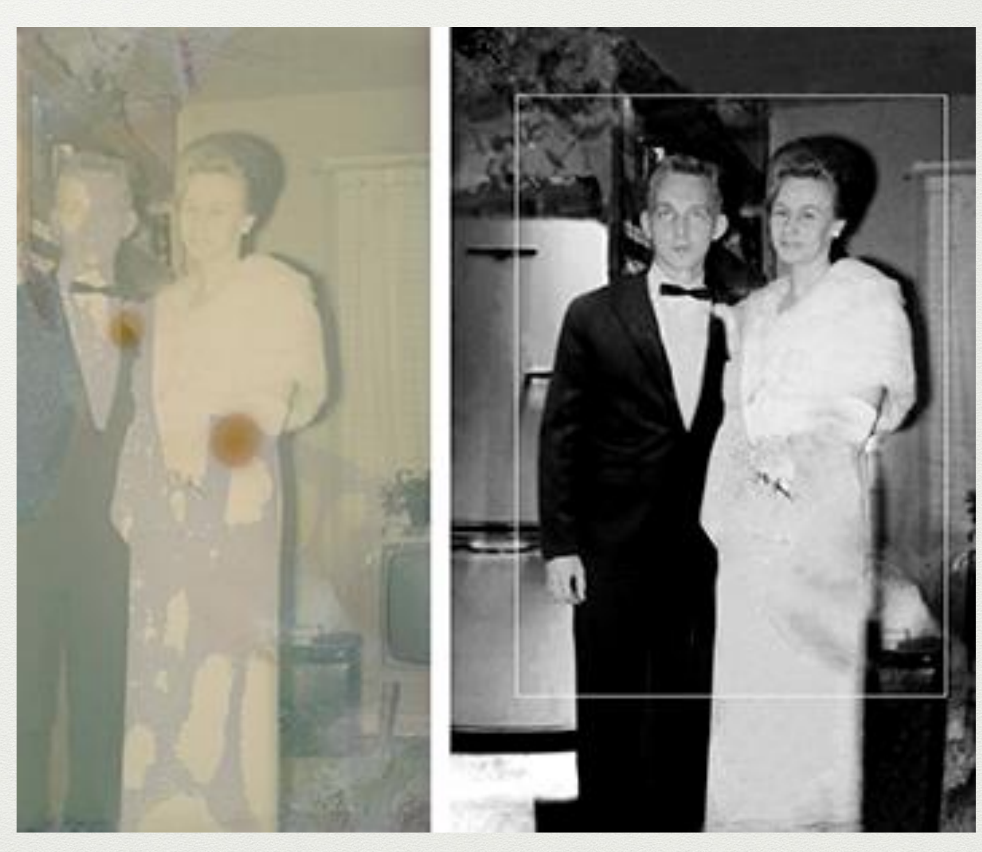
Color Photo Restoration to Black and White