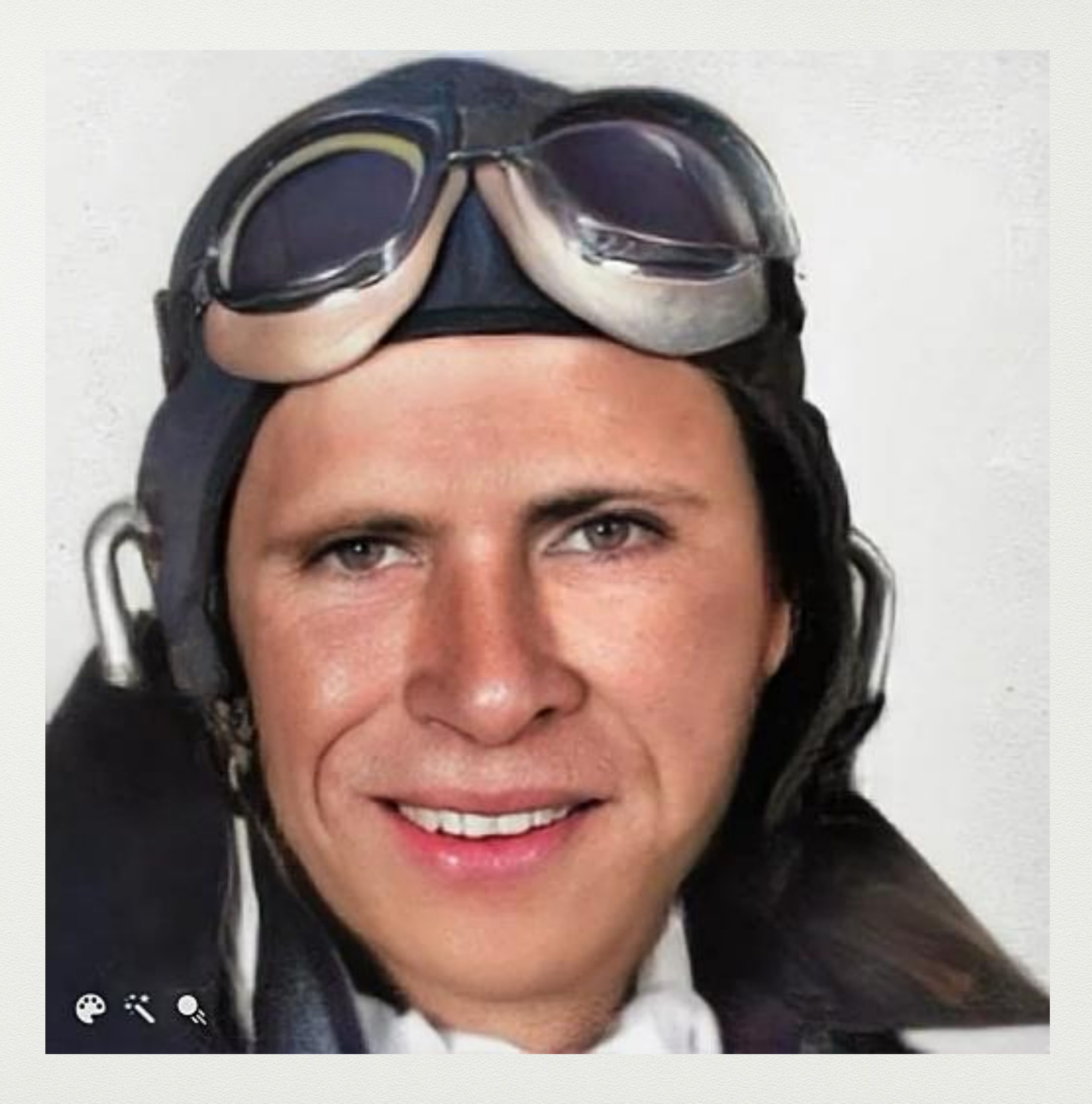
My Heritage: Repaired, Enhanced, Colorized, and Animated.