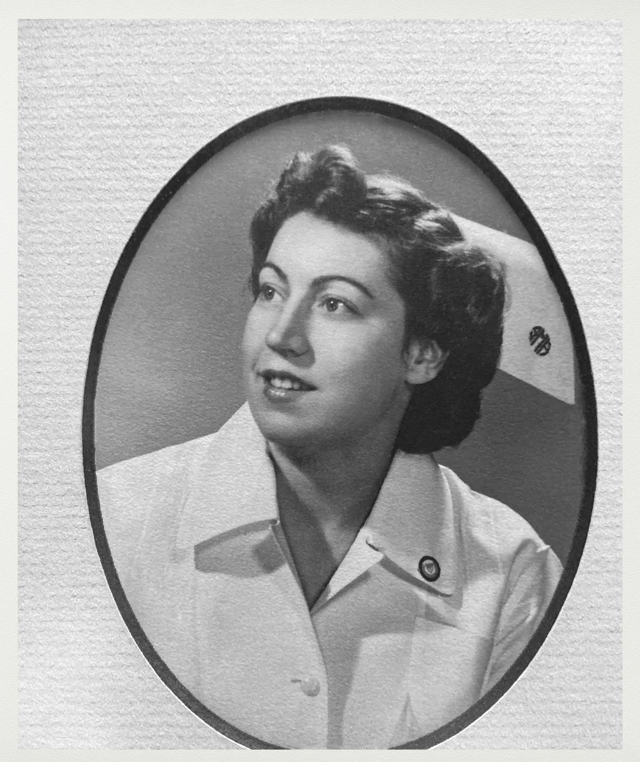
Repaired on Photoshop