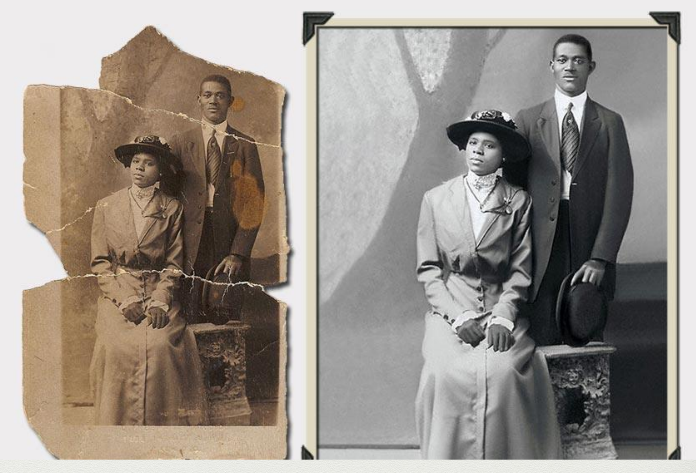
Correction includes filling missing areas.