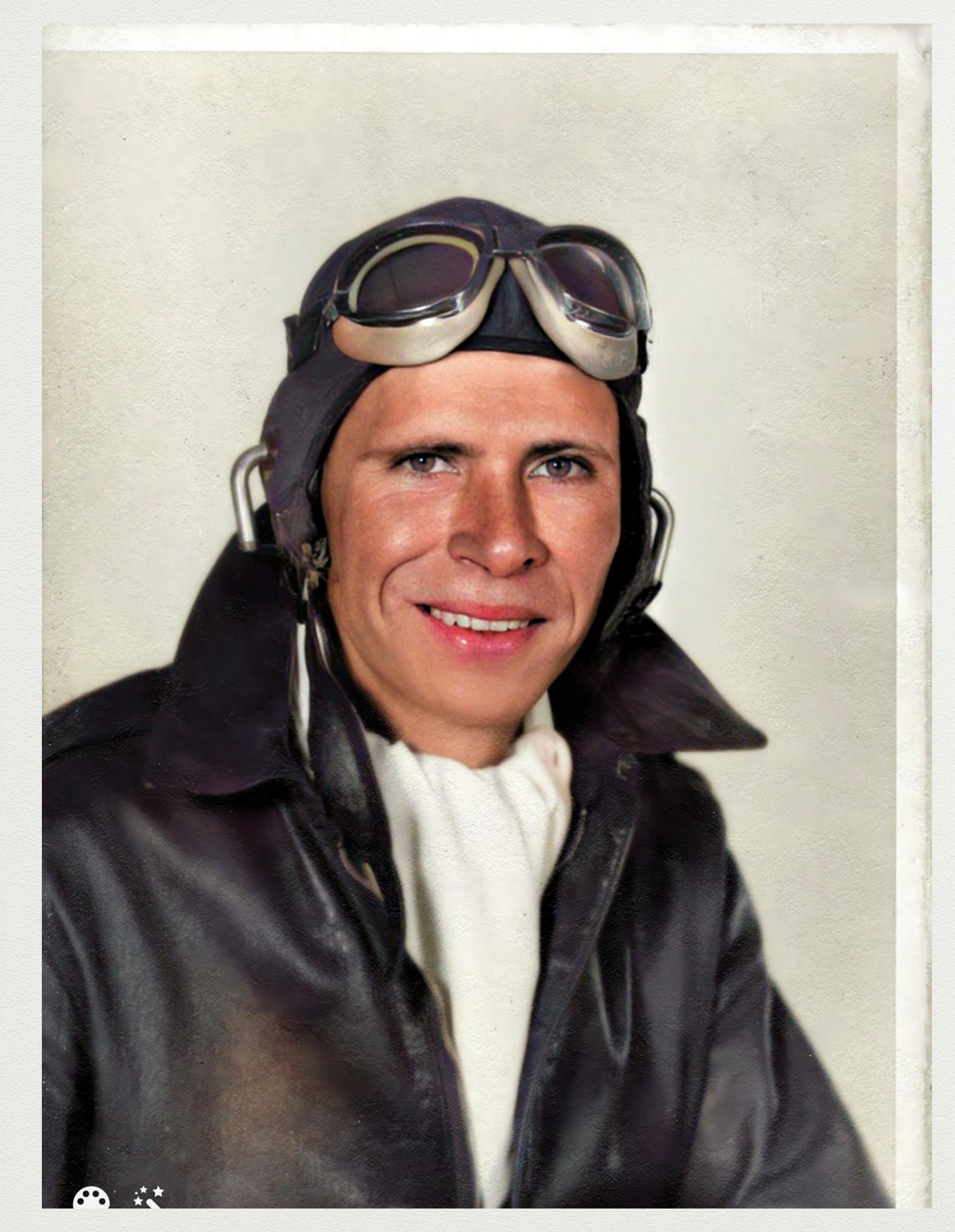
My Heritage: Repaired, Enhanced, Colorized