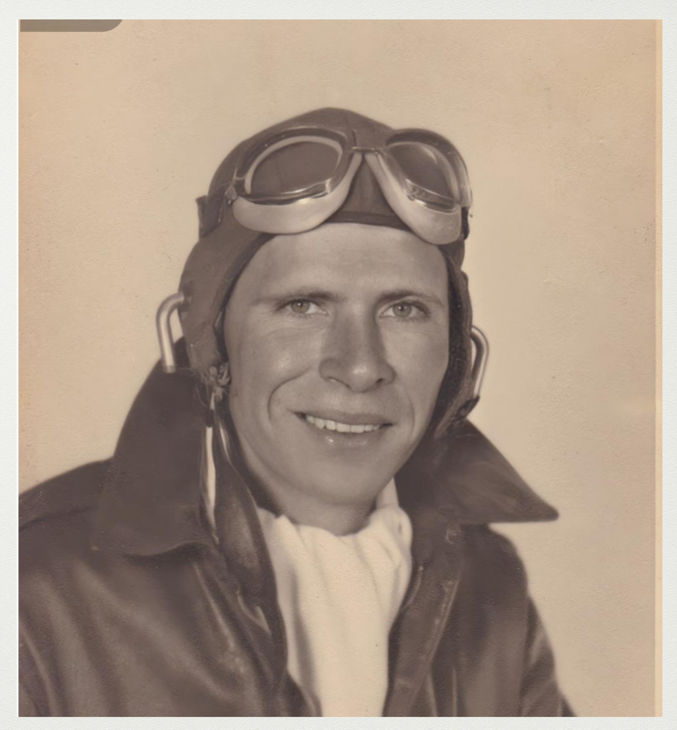
My Heritage Repair and Enhance