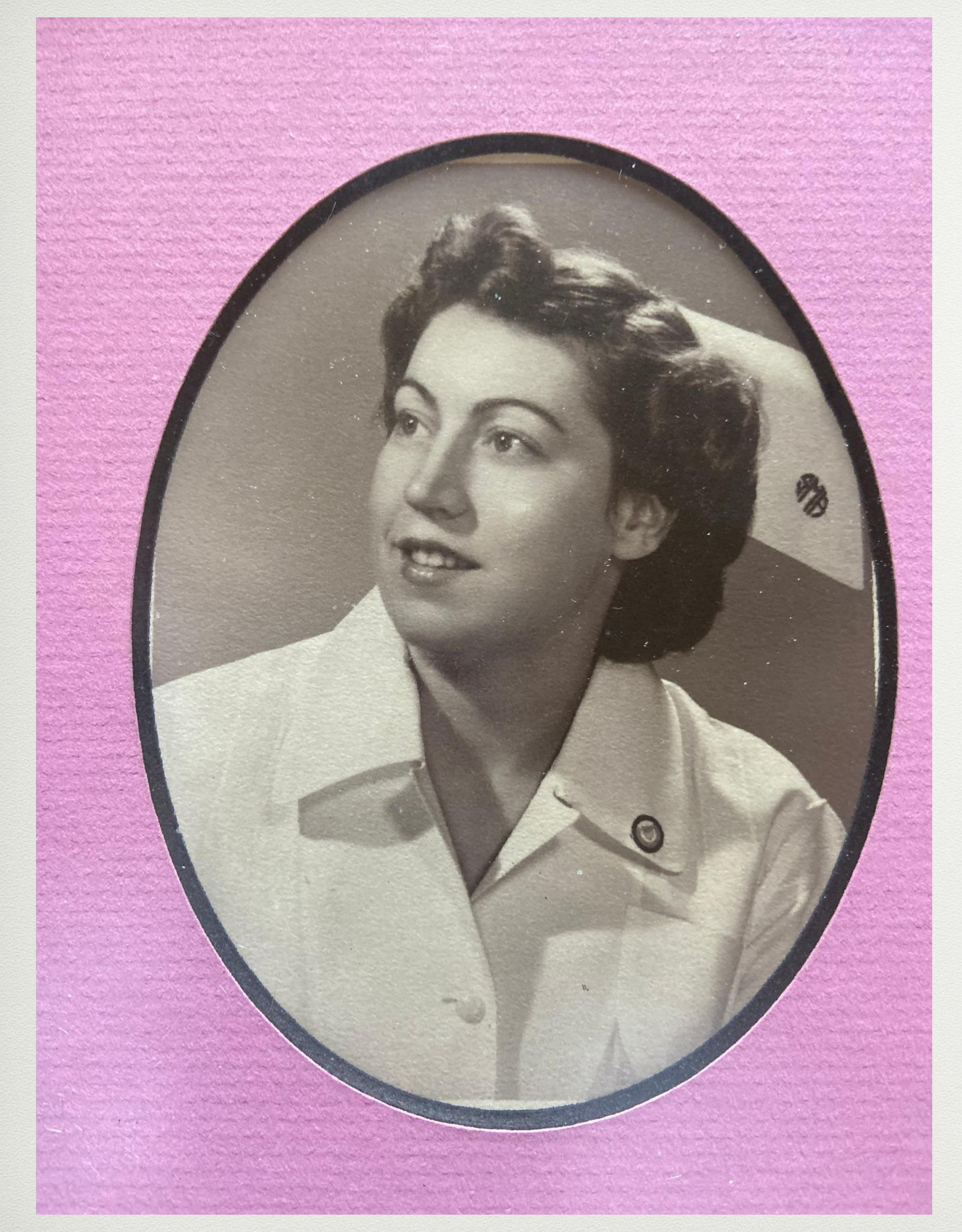
Original off Facebook