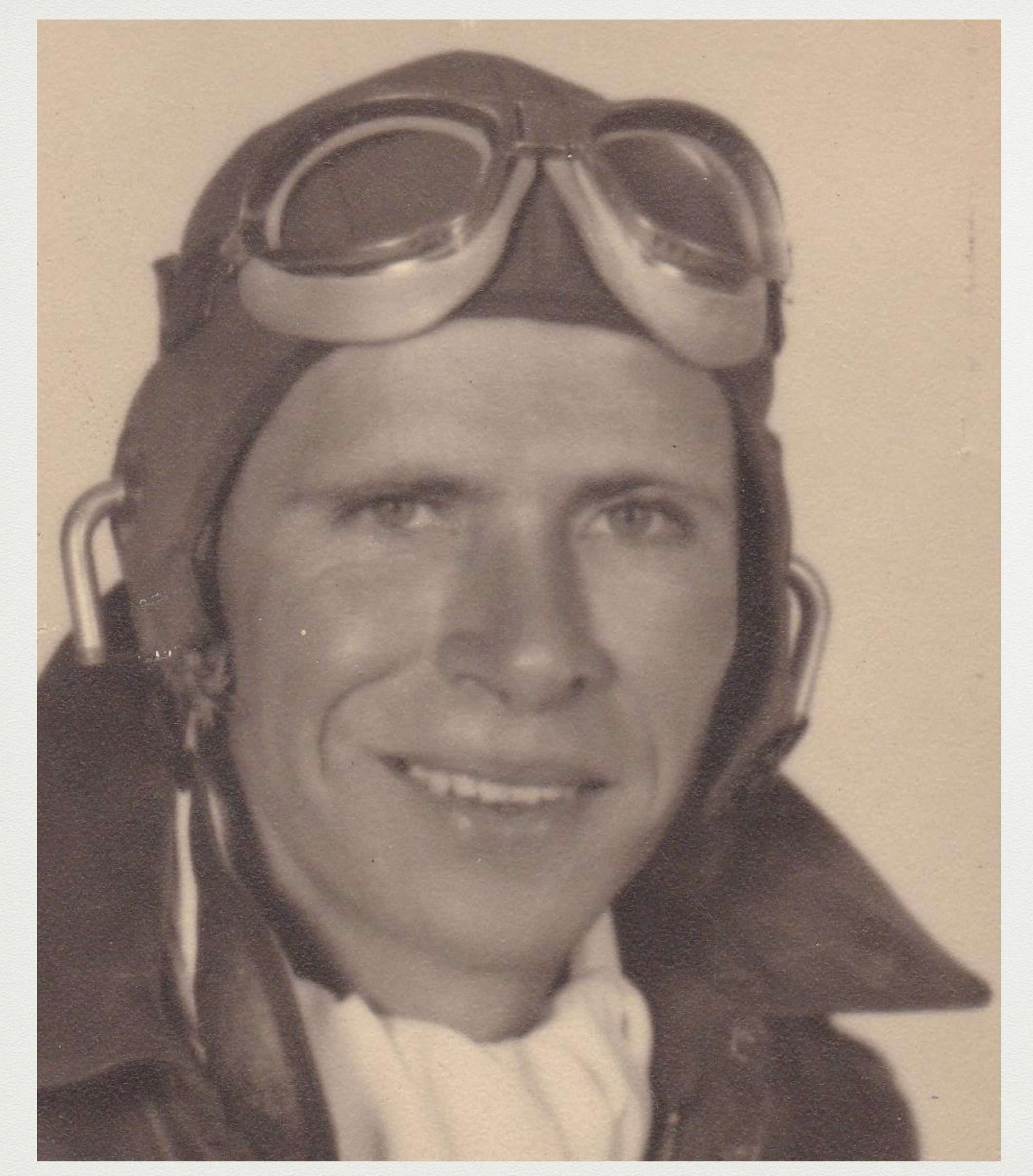
My Heritage Original